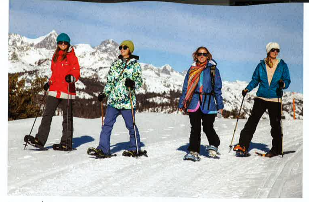
Four snowshoers at Minaret Vista with Ritter and Banner in the background

Slocums Grill and Bar, Mammoth Lakes' version of Cheers since 1983, is still a favorite hangout with one of the best happy hours in town.