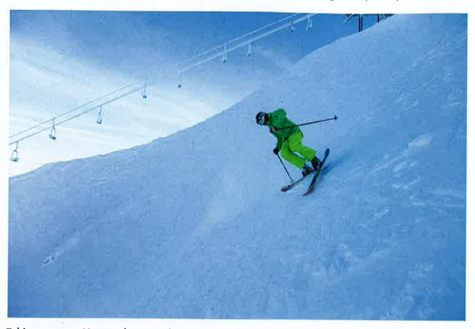
Taking turns on Mammoth Mountain