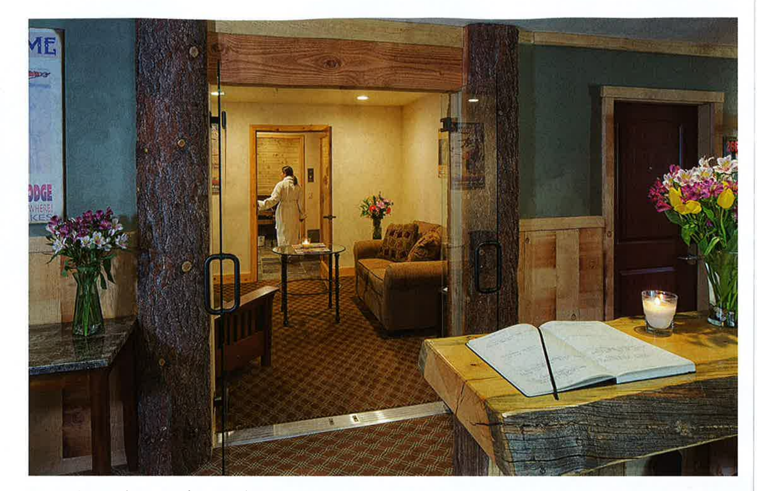
Spa reception area

Shop to hang out and play games at the shop's multiple game stations, or pick one out to take back to the condo.